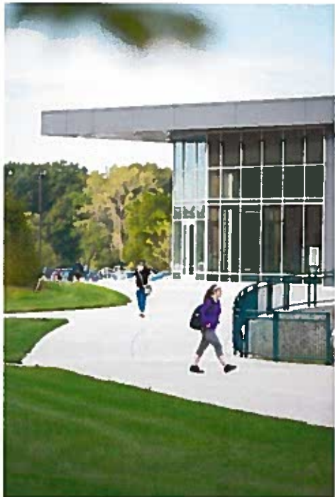
Source: University Budget Office