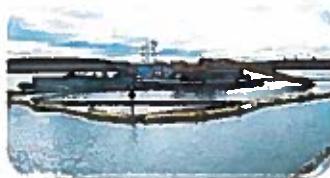
Muskegon Lake Area of Concern