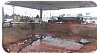
Alpena South E-Z Mart