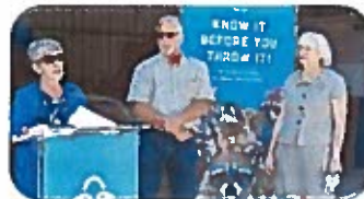
Alpena Resource Recovery Facility