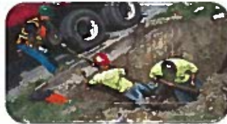
City of Flint