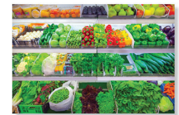
Buy healthy food