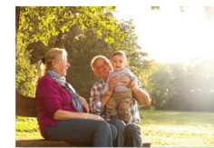
... and make their city, town or neighborhood a lifelong home.