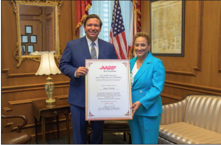
State of Florida