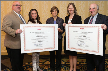
Ithaca and Tompkins County, New York