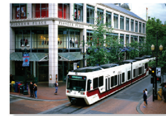
Get around without a car