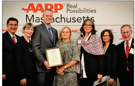
Commonwealth of Massachusetts

See the complete list of enrolled communities: AARP.org/AgeFriendly-Member-List