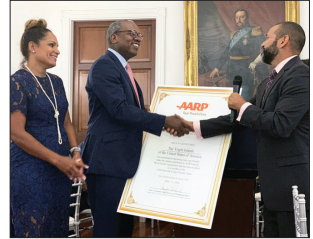
U.S. Virgin Islands