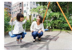
Enjoy public places