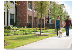
Go for a walk