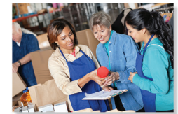
Work or volunteer