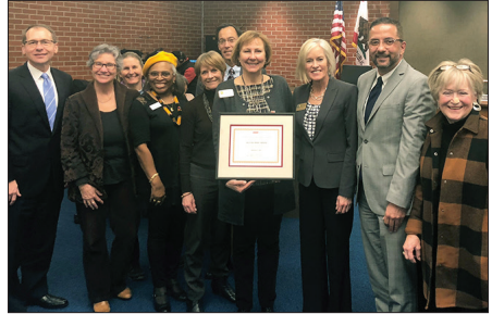
San Rafael, California