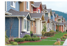
Live safely and comfortably