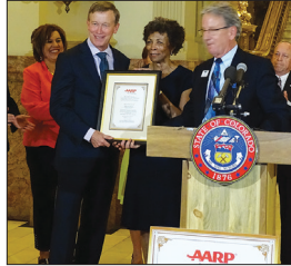
State of Colorado