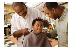
Find the services they need