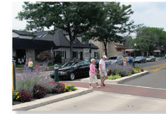
Cross the streets