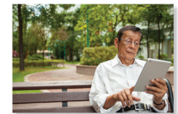
Spend time outdoors