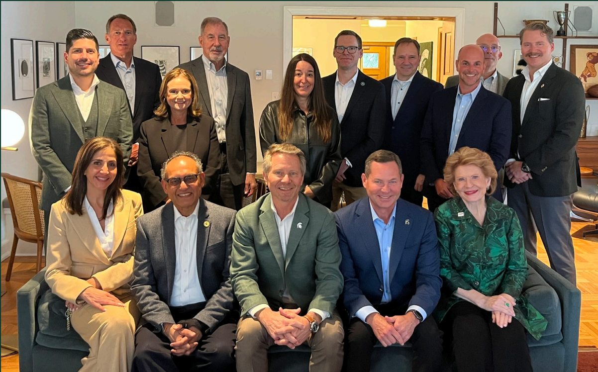
Green and White Council