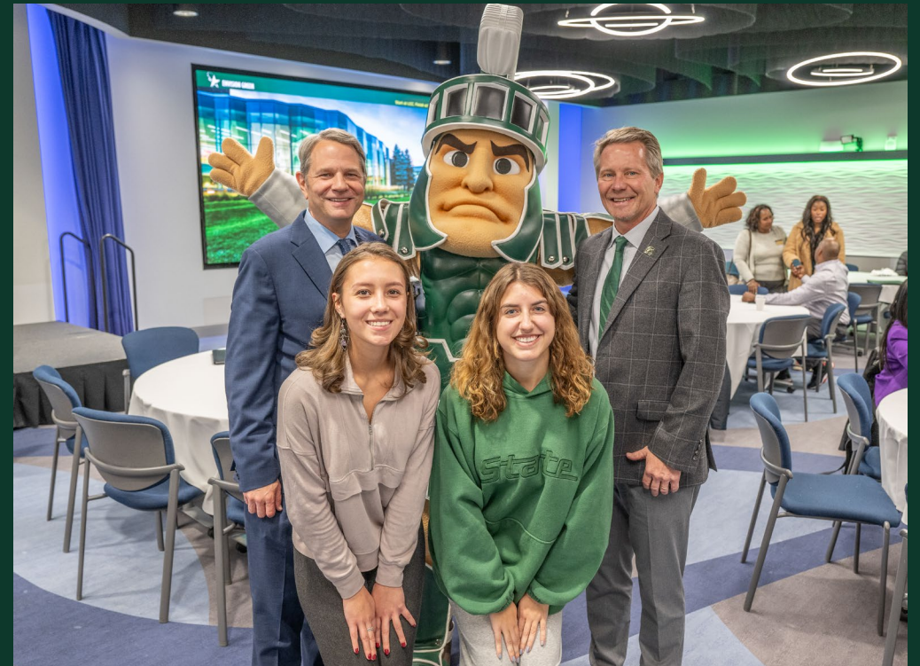
Envision Green – LCC Transfer Partnership