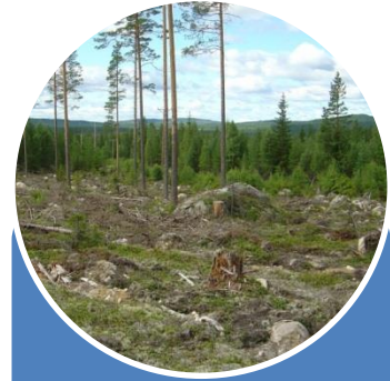
Forest, Wetland and Habitat (FWH)