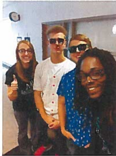
Saginaw ISD Transitions Center, College Fair, 2016.