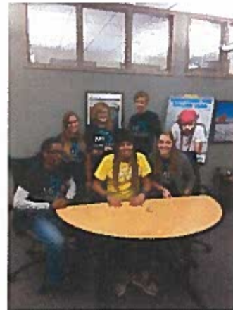
MI Student Aid Outreach Team w/Dee-1, 2016.