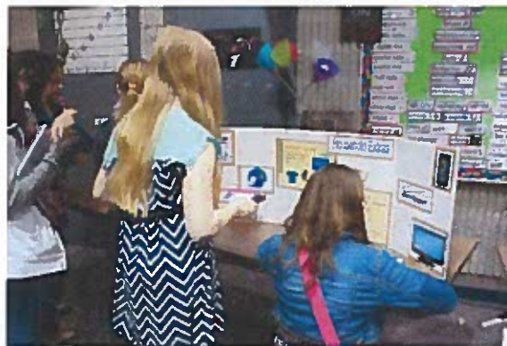
Harbor Lights Middle School Holland, MI, 2016.