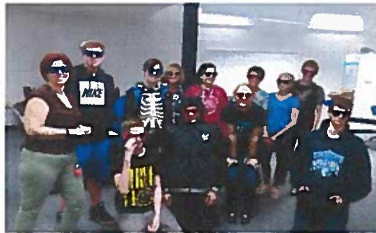
Stevenson High School Livonia, MI, 2016.