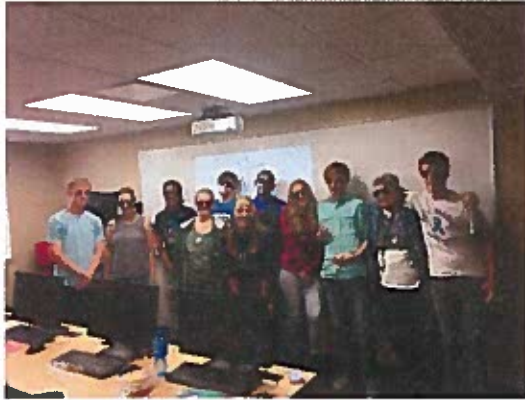
Davenport University Lansing, MI, 2016.