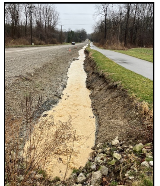
Roadside ditch along East Clarkston Road

The Township is working in collaboration with the Road Commission for Oakland County to secure funding for this crucial project. Currently, funding is available to cover 50% of the total project costs, but we still need to secure the remaining 50%. The total estimated cost of the project is approximately $6,000,000, which includes paving about 4,800 feet of East Clarkston Road and implementing the necessary stormwater treatment measures. The Township is seeking an additional $3,000,000 to complete this project.