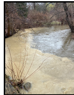
Impact to Paint Creek

In addition to navigation challenges, there are significant environmental concerns to address. This section of the road negatively impacts Paint Creek, which is one of the last cold-water trout streams in Southeast Michigan. Paint Creek acts as the natural stormwater outlet for runoff in the region, and the gravel from East Clarkston Road continuously contributes sediments that harm this sensitive stream. Please refer to the adjacent photos that illustrate the current impact this unpaved section of Clarkston Road has on Paint Creek.