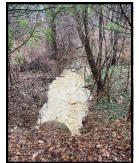
Discharge to Paint Creek