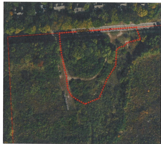
Current - Dump covered & vegetated

1960-1970 USED AS UNLINED TRASH DUMP (~2.5 ac. off Brighton Rd.)