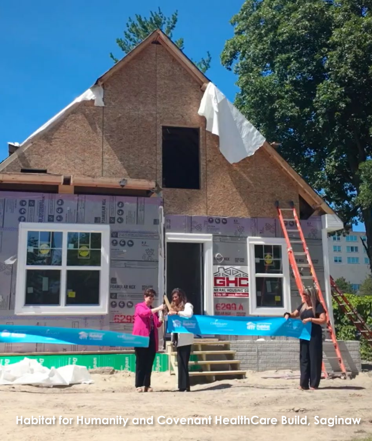
Habitat for Humanity and Covenant HealthCare Build, Saginaw