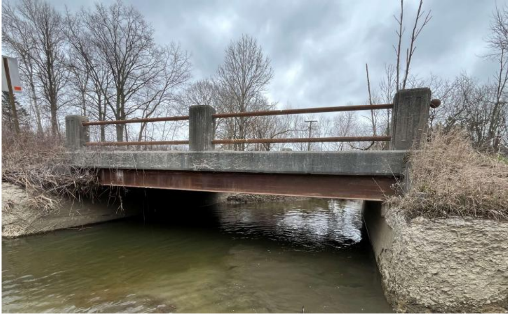
Bridge with outdated railing and heavy rusting