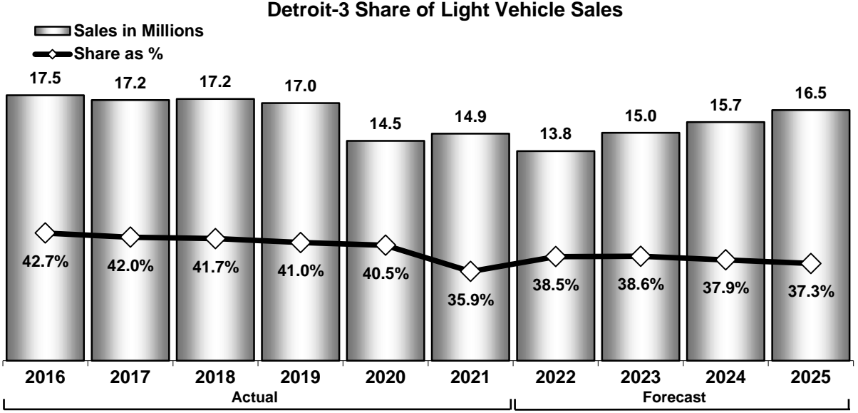
Figure 2 Detroit-3 Share of Light Vehicle Sales

The level and composition of light motor vehicle sales as well as the extent to which the domestic nameplates can retain market share will have a direct impact on Michigan's economy. In CY 2022, the Detroit-3 is expected to sell just over 5.3 million vehicles, which would translate to an 0.6% decrease from CY 2021. It is projected that the Detroit-3 will sell approximately 5.8 million vehicles in CY 2023 before sales increase to around 6.0 million units in CY 2024 and 6.1 million units in CY 2025.