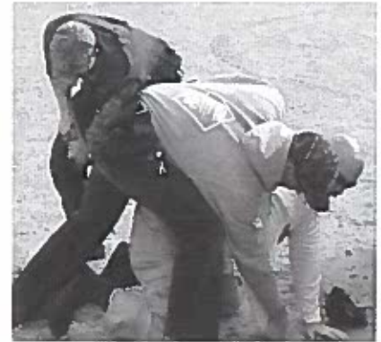
High Risk Felony Traffic Stops Academy Scenarios Ferris State University

But recruits learn quickly what is expected of them in a contrived scenario so it becomes important to provide a variety of fact patterns. In the book No Easy Day , a member of Seal Team Six recounts the true story of the killing of Osama Bin Laden. He recalled how the team practiced their mission over and over at a mock compound. But as the real mission unfolded, their rehearsed procedures had to be changed because a helicopter crashed at the scene. The implications for law enforcement training are clear. Officers must have the ability to make adjustments on the fly as ingrained procedures in the academy give way to evolving situations on the job.