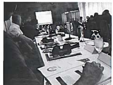
At the Baltic Region Police Conference