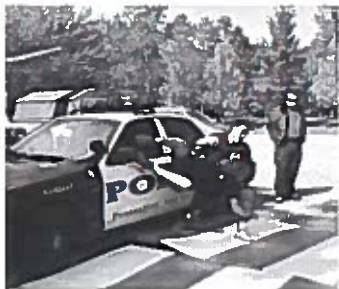
Kirtland Academy Scenarios Vehicle Extraction

As a first step, we modified the pass/fail requirements in emergency vehicle operations, firearms, and subject control to increase hours for reality based training. The changes did not lower the standards, but less time is now needed for recruits to demonstrate competency in the skill areas. We then modified the first aid module so starting next year recruits will be required to have CPR and AED as prerequisites for entry into the academy, which also made room for