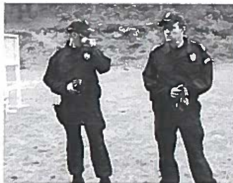
Serbian Firearms Instructors