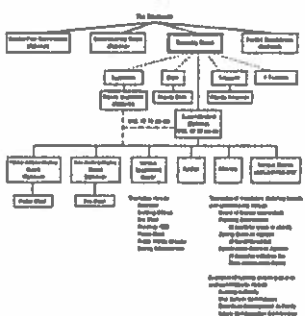
Typical Organization Chart Charter Township The Charter Township Act, Public Law 224 of 1947 MCL 47.1, 47.102