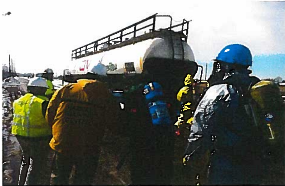
Detroit Training Exercise